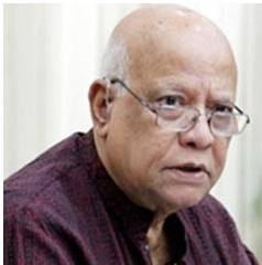
Abul Maal A Muhith

Ministers from Bangladesh, Germany and Uganda lead the Global Partnership and advocate for effective development co-operation across the globe.